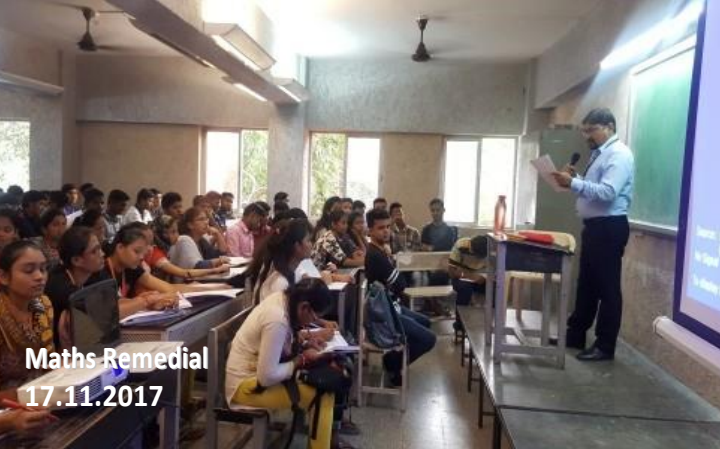
Maths Remedial 17.11.2017