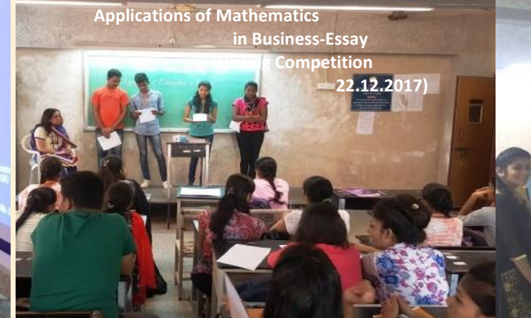
Applications of Mathematics in Business-Essay Competition (22.12.2017)