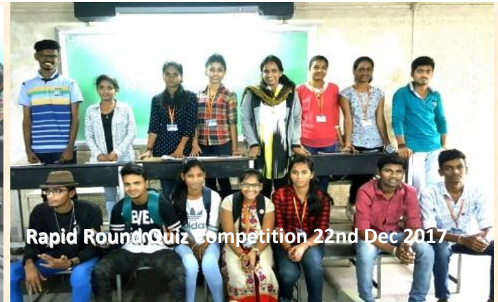
Rapid Round Quiz Competition 22nd Dec 2017