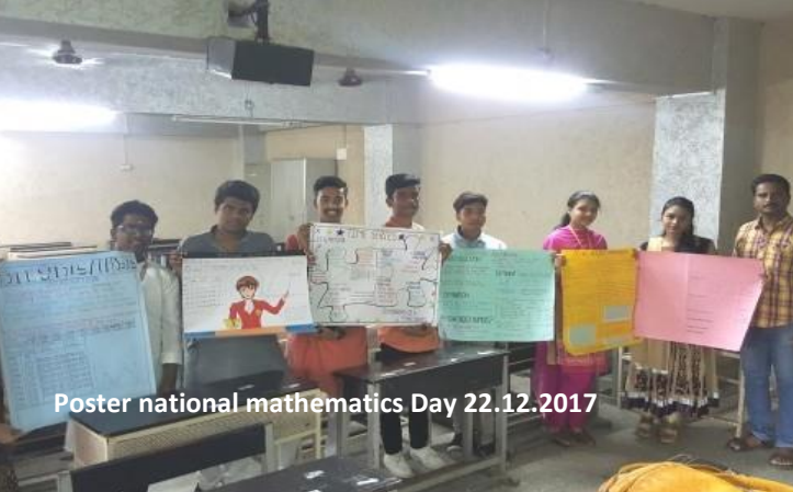
Poster national mathematics Day 22.12.2017