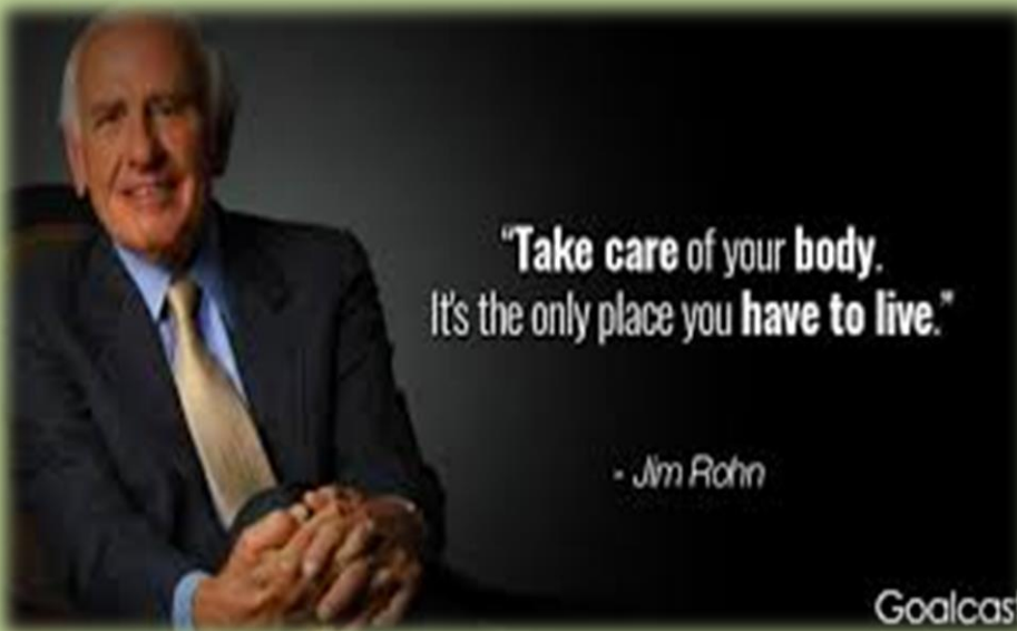
- Jim Rohn