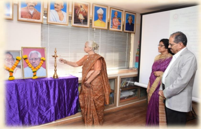
One day Multidisciplinary National Conference On "Recent trends and issues in Commerce, Management and Economics: A road map to change India's future" Jointly organised by UG (Commerce)& PG department On 24 th March, 2018