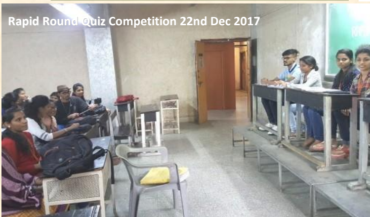
Rapid Round Quiz Competition 22nd Dec 2017